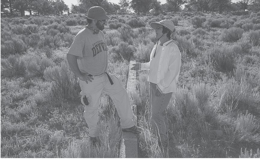
FIGURE 5.5. Excavation crew chief and former internee volunteer talk at the site of her family's barrack.

the nearby barracks (figure 5.5). One man, who was born at Amache and had never before returned, retold one of the few stories about camp his mother shared with him. With his extended family to witness, he spoke of how he had crawled too near the single heat source in each barrack, the potbelly stove. He then lifted his pant leg to show us all the scar that still marked where he had been burned. The scars of internment are many; this one is literal.