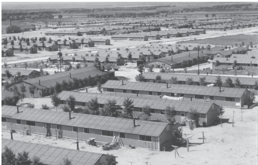
FIGURE 5.2. Panorama of Amache showing common internee modifications to the landscape including tree plantings, gardens, and laundry lines.

so the wire we found was scavenged, or more likely stolen, from stores of camp construction materials. That is probably the same source for the cinderblock out of which the beds were made. Those who built the garden took great pains to hide the material's industrial nature; each block was carefully split into three portions and laid in a way that disguises the defining features of the block, its circular center holes. Without rather close inspection, the pieces appear to be carefully quarried basalt blocks, a material that would have been familiar to any gardener practicing in California.