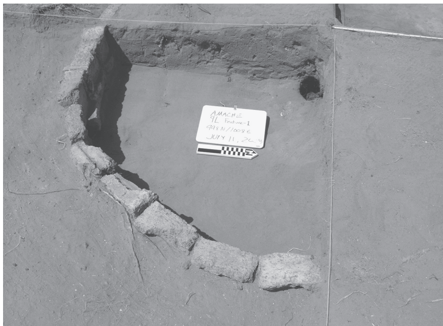
FIGURE 5.4. Oval garden in Block 9L after test excavations, 2008. Remains of the tree planted in the center of the bed visible at the top of the image.

records document the landscaping of the barracks block that was used as the elementary school. Like the rest of the camp, it had been denuded of all vegetation during construction. As the principal of the Amache school wrote in an education journal, “Passage from room to room, to library, office, or lavatory, could be attained only by stepping out in the periodic fury of dust and sand” (Dumas and Walther 1944:40).